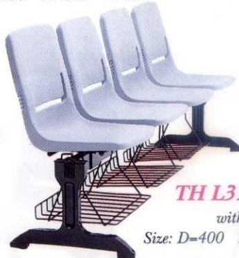
TH L31 (Rack)