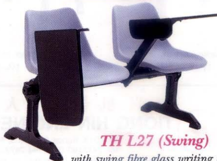
TH L27 (Swing)

with swing fibre glass writing tablet Size: D=400 H=820 L=1150