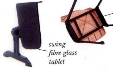
swing fibre glass tablet

Polypropylene side cover Protection of staking