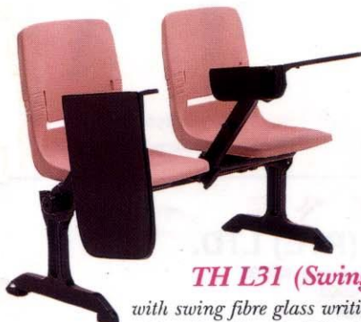
TH L31 (Swing)

with swing fibre glass writing tablet Size: D=400 H=820 L=1150