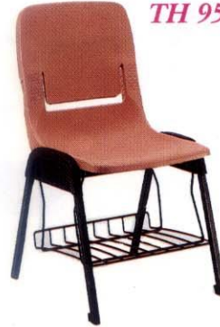
TH 9520 Rack

Polypropylene seat with 19mm square M.S tube base with polypropylene side cover Size: D=400 W=460 H=850