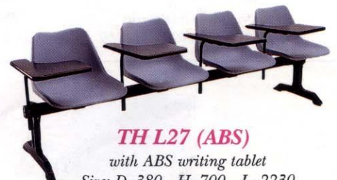
TH L27 (ABS)

with swing fibre glass writing tablet Size: D=380 H=700 L=1230